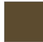
14 ●● 丝绒褐 Velvet Brown