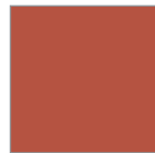
25 ●● 生赭 Raw Sienna