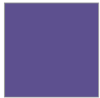
29 ●● 帕尔马紫罗兰 Parma Violet