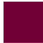
20 ●● 土红 Red Ochre