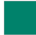
15 ●● 宝石翠绿 Emerald