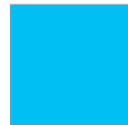
35 ●● 荧光蓝 Fluorescent Blue