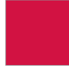
24 ●● 正红 Cardinal Red