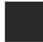
19 ●● 黑色 Black