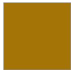
05 ●● 浅黄褐 Fawn