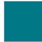
30 ●● 青绿 Turquoise