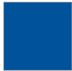
12 ●● 群青 Ultramarine Blue