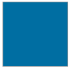
02 ●● 靛青 Indigo