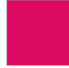
22 ●● 孟加拉粉红 Bengal Pink