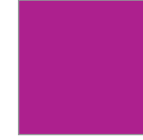
49 ●● 桃红 Fuchsia