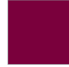
23 ●● 东方红 Oriental Red