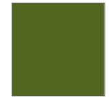
28 ●● 苔藓绿 Moss Green