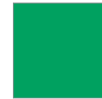
04 ●● 草绿 Lawn Green