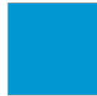
03 ●● 天蓝 Sky Blue